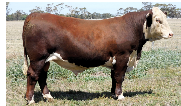
DAYS LANDLORD T064