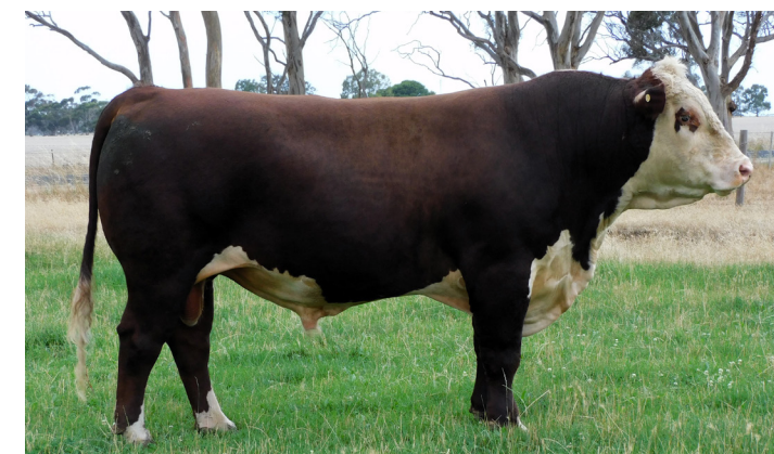
DAYS MILESTONE S138