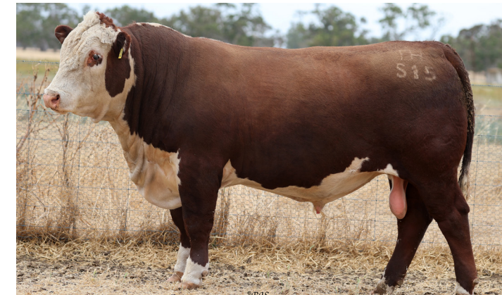
TOBRUK SOUTHERN CROSS S015

Selection criteria is centred around genomics, objective measurement and Breedplan performance. Semen available in all sires please head to our website for more information.