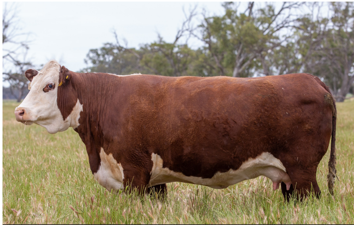
DAM OF GODFATHER BULLS INCLUDING LOTS 1, 16 & 39