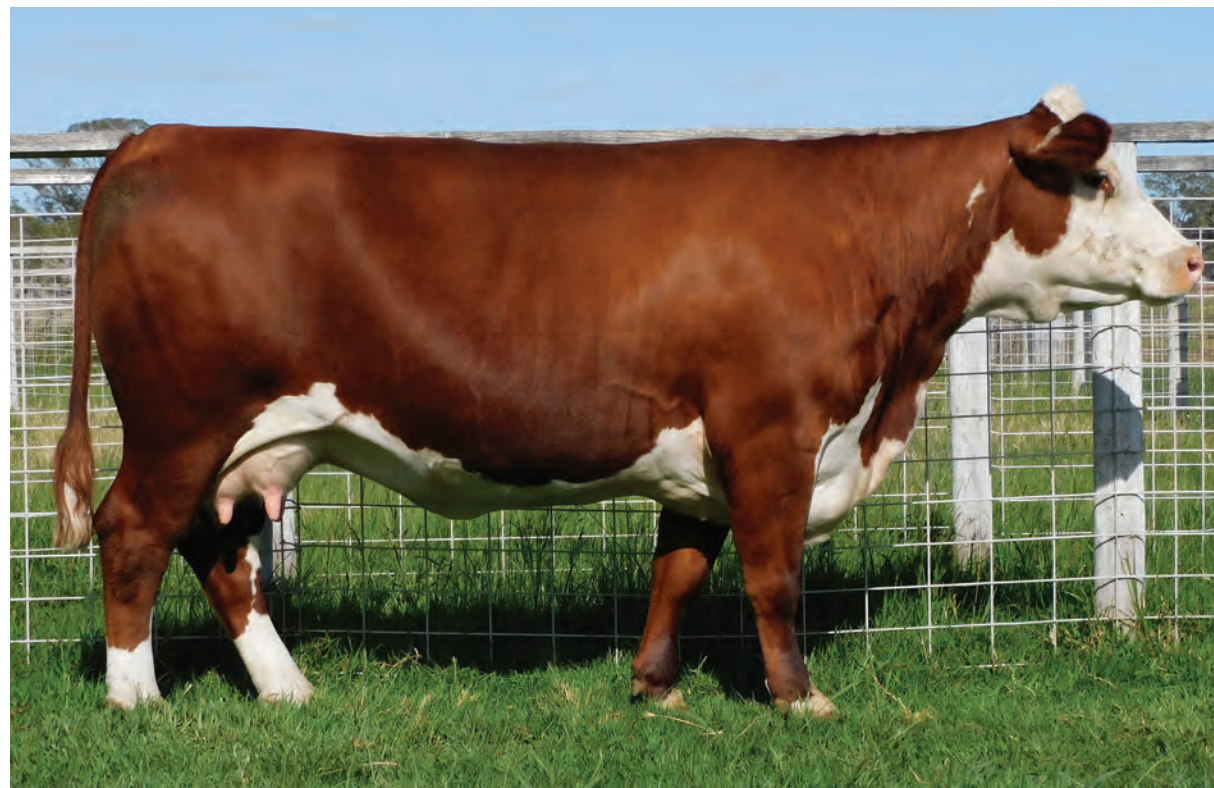
DAM OF DAYS KING PIN Q201 AND LOT 10