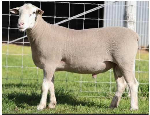
WHITE SUFFOLK Lot 28 143 TW