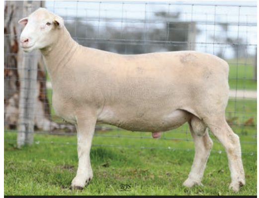
POLL DORSET Lot 46 159