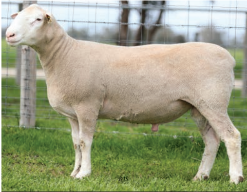
POLL DORSET Lot 33 194