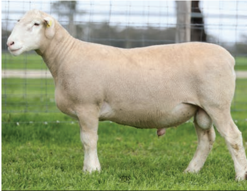
POLL DORSET Lot 39 191