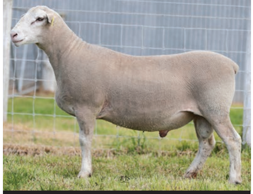
WHITE SUFFOLK Lot 26 517 TW