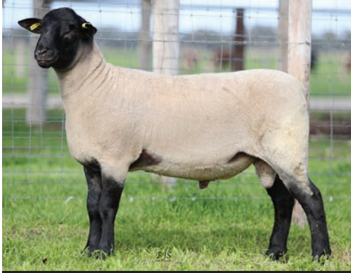
SUFFOLK Lot 13 864 TW