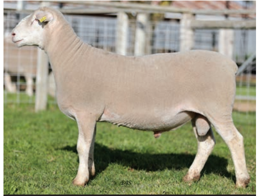
WHITE SUFFOLK Lot 32 233