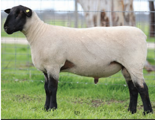
SUFFOLK Lot 7 859