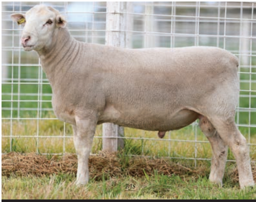
WHITE SUFFOLK Lot 27 246 TW