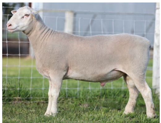
WHITE SUFFOLK Lot 24 088 TW