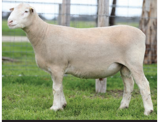
POLL DORSET Lot 44 322