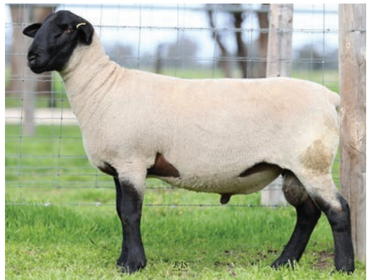
SUFFOLK Lot 12 922