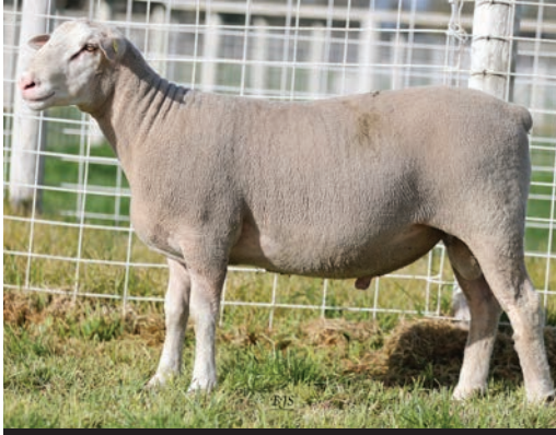
WHITE SUFFOLK Lot 19 297