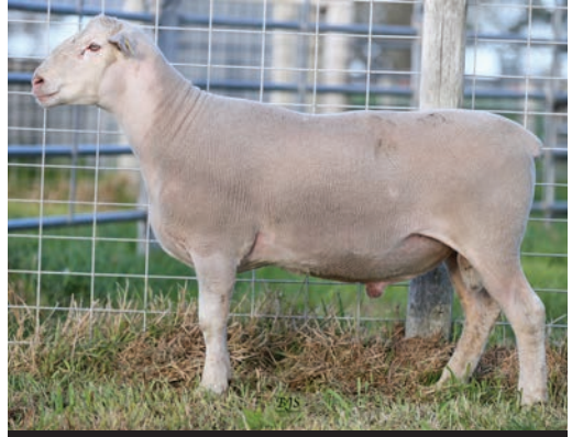
WHITE SUFFOLK Lot 20 066