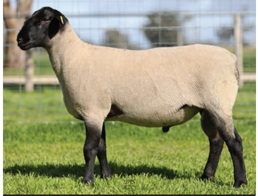
SUFFOLK Lot 14 756 TW