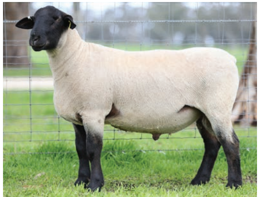
SUFFOLK Lot 6 827 TW