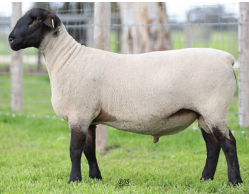
SUFFOLK Lot 5 954