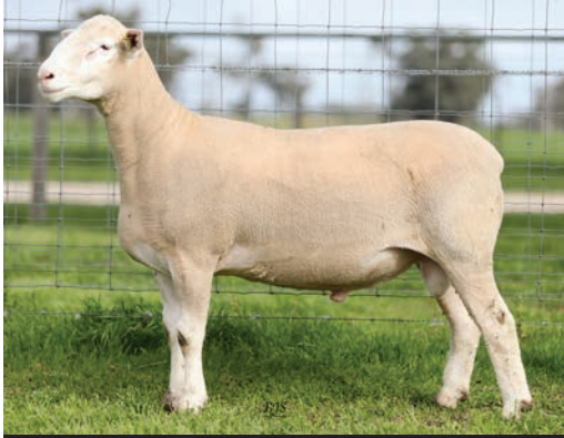
POLL DORSET Lot 37 249 TW