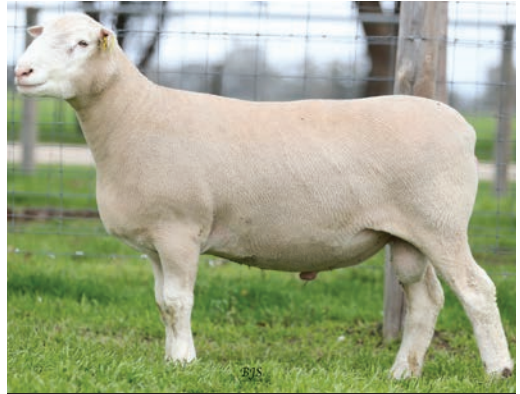
POLL DORSET Lot 34 163