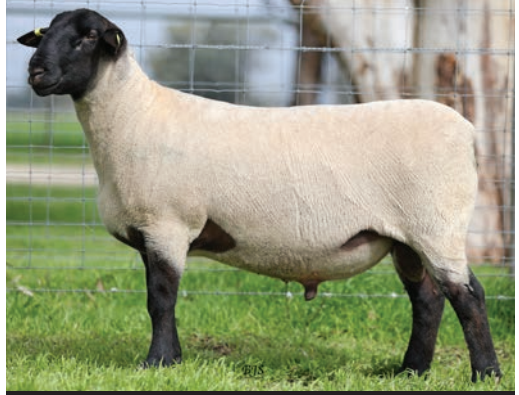
SUFFOLK Lot 2 953 TW