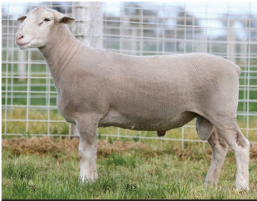
WHITE SUFFOLK Lot 21 378