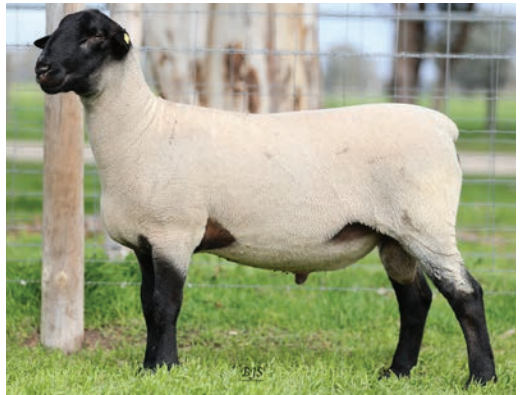
SUFFOLK Lot 16 968