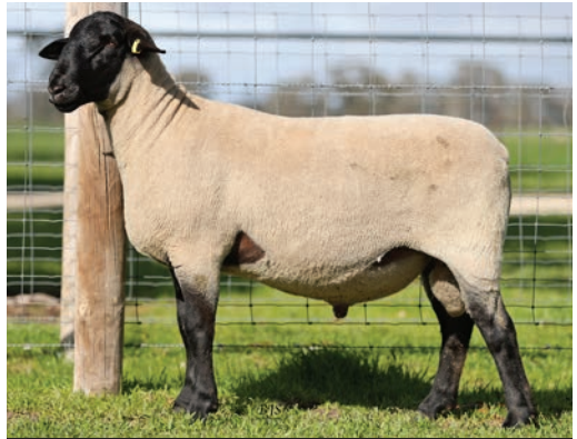
SUFFOLK Lot 4 951 TW