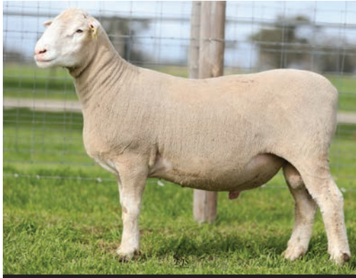
POLL DORSET Lot 45 183 TW