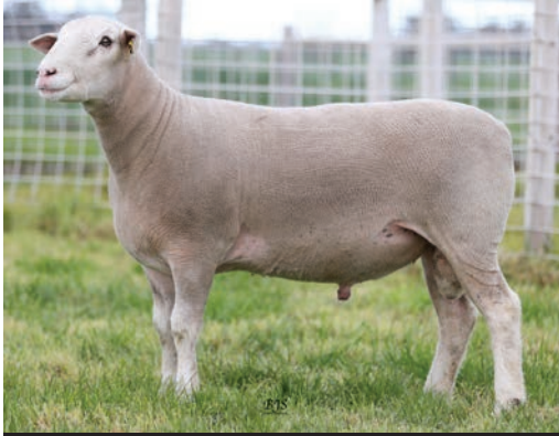
WHITE SUFFOLK Lot 31 333 TW