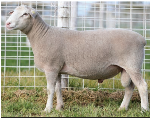
WHITE SUFFOLK Lot 29 055 TW