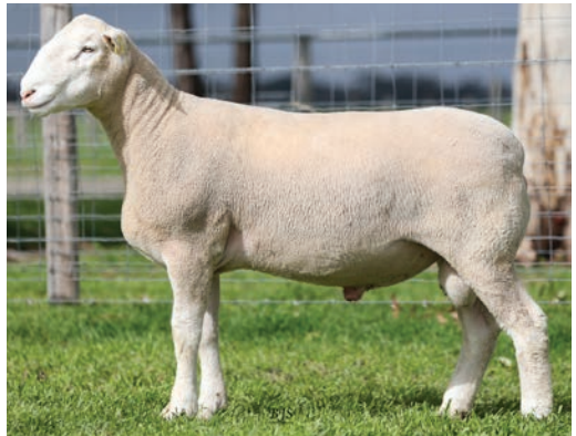
POLL DORSET Lot 42 033 TW