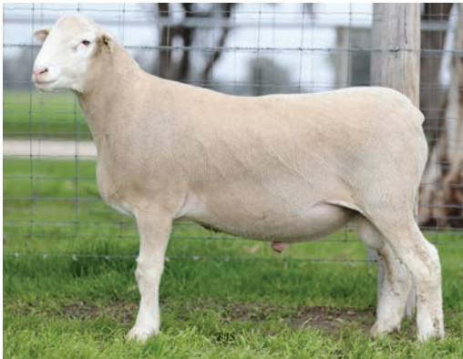
POLL DORSET Lot 41 045 TW