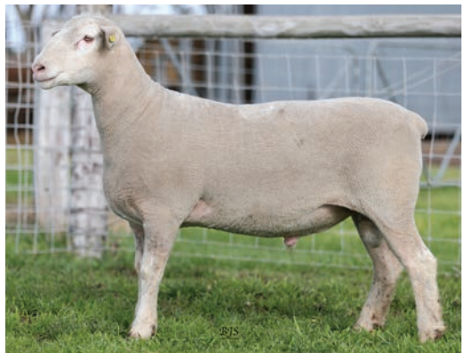
WHITE SUFFOLK Lot 18 089 TW