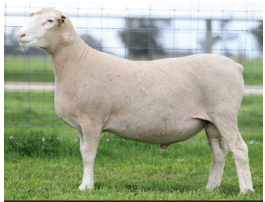
POLL DORSET Lot 48 095 TW