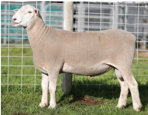
WHITE SUFFOLK Lot 17 107 TW