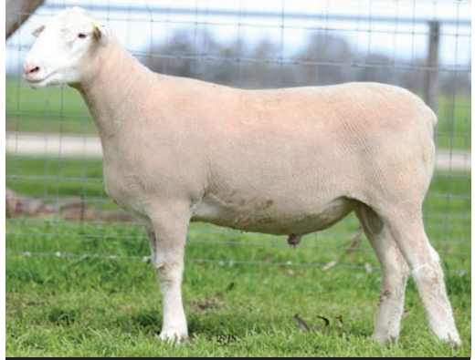
POLL DORSET Lot 38 010