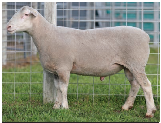
WHITE SUFFOLK Lot 30 061 TW