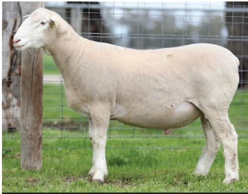
POLL DORSET Lot 47 272