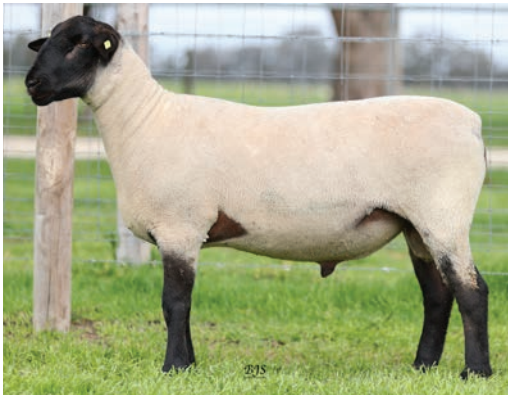
SUFFOLK Lot 15 858