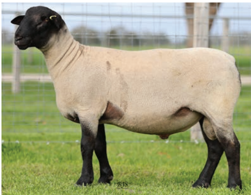
SUFFOLK Lot 11 958 TW