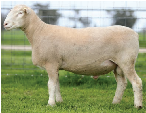
POLL DORSET Lot 35 361 TW