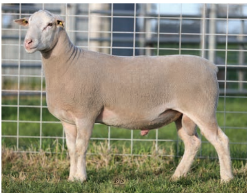
WHITE SUFFOLK Lot 23 268