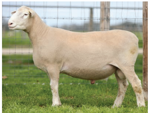
POLL DORSET Lot 36 149 TW