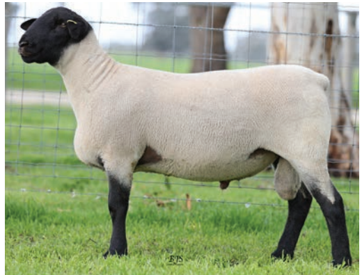
SUFFOLK Lot 10 804