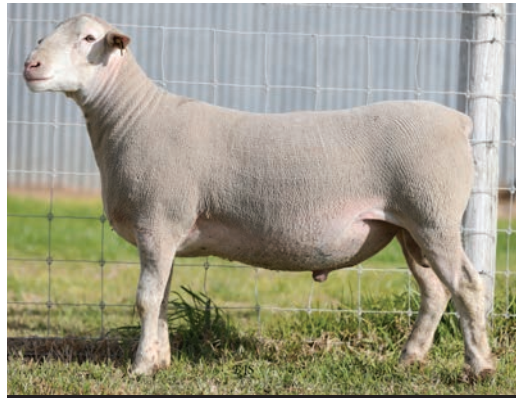
WHITE SUFFOLK Lot 22 135 TW