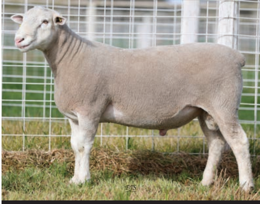
WHITE SUFFOLK Lot 25 300