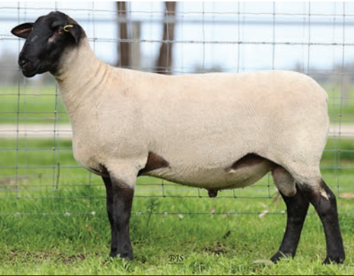
SUFFOLK Lot 3 955