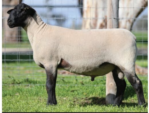
SUFFOLK Lot 8 802 TW