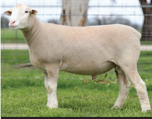
POLL DORSET Lot 43 287 TW