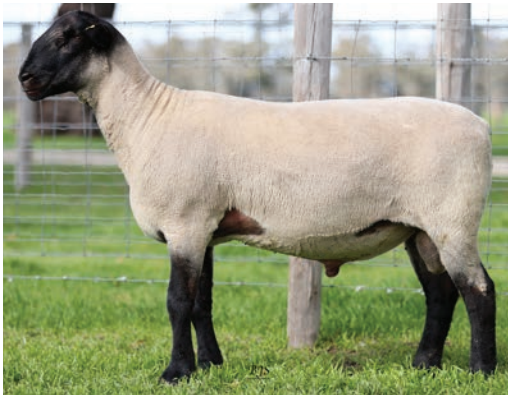
SUFFOLK Lot 9 840