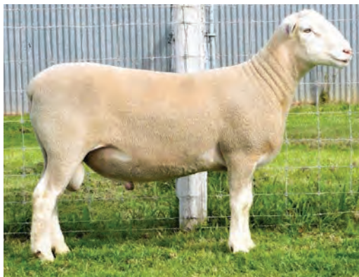
WHITE SUFFOLK Lot 16 200030