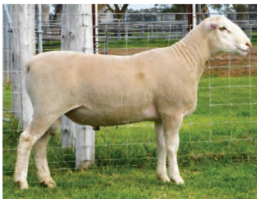
WHITE SUFFOLK Lot 17 200043