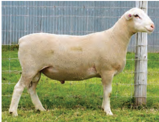
WHITE SUFFOLK Lot 25 200340 TW