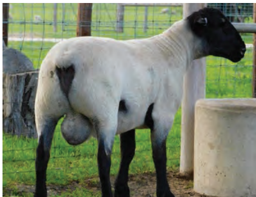
SUFFOLK Lot 15 594