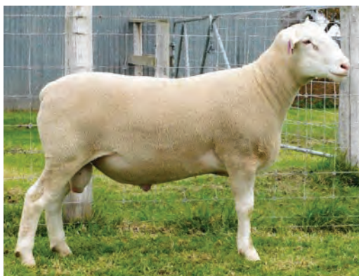
WHITE SUFFOLK Lot 29 200163 TW