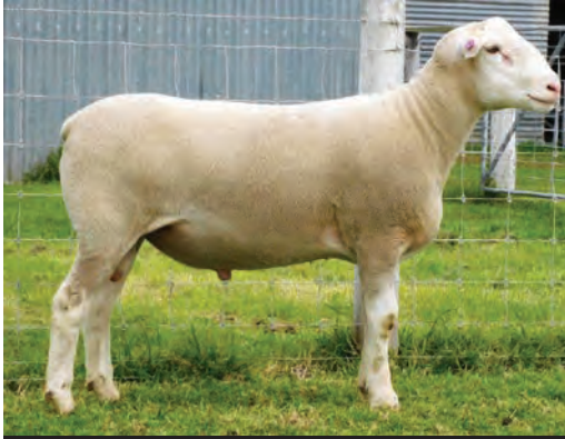
WHITE SUFFOLK Lot 19 200396