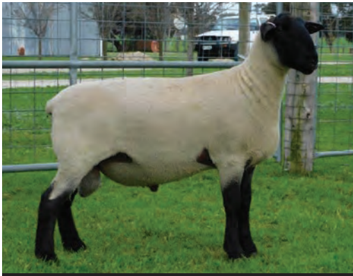
SUFFOLK Lot 11 711 TW