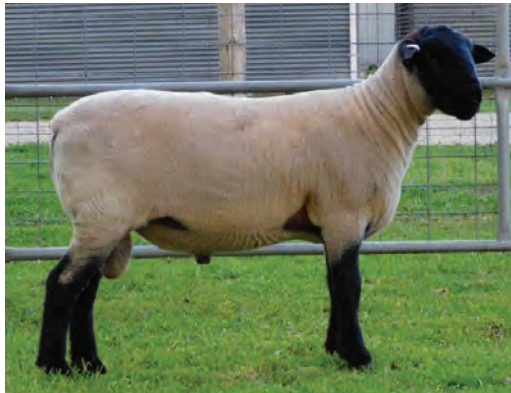
SUFFOLK Lot 14 673 TW