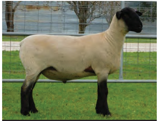
SUFFOLK Lot 12 605