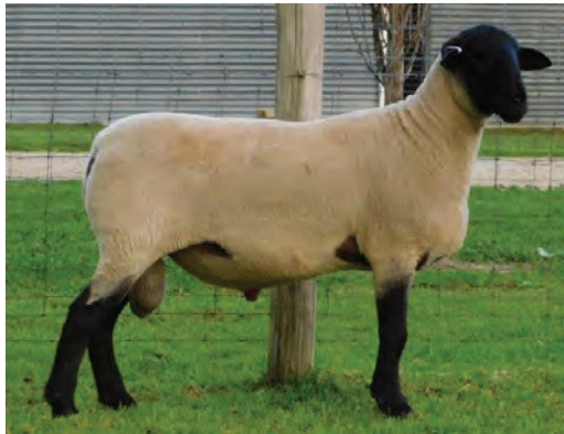
SUFFOLK Lot 13 558 TW