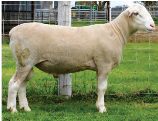
WHITE SUFFOLK Lot 26 200210 TW