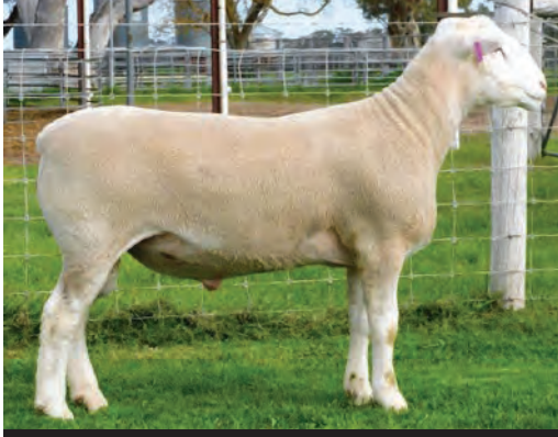
WHITE SUFFOLK Lot 31 200381 TW