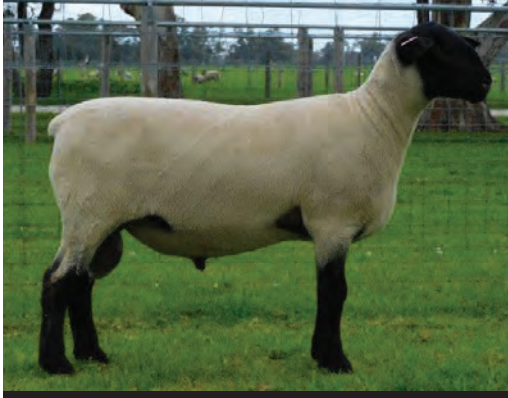
SUFFOLK Lot 7 503 TW