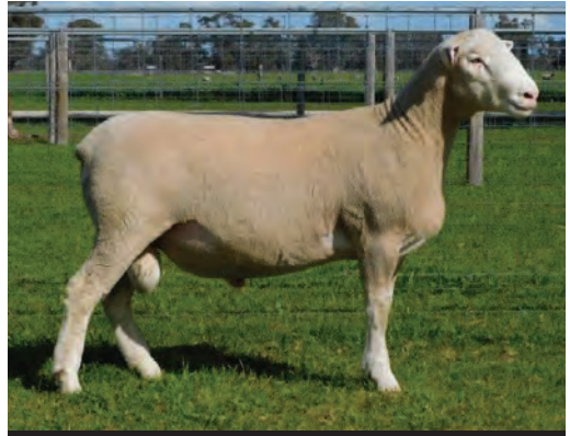
POLL DORSET Lot 34 188 TW