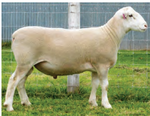
WHITE SUFFOLK Lot 18 200440