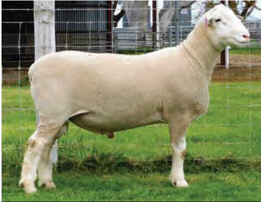
WHITE SUFFOLK Lot 21 200180 TW