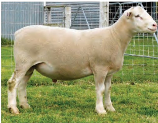
WHITE SUFFOLK Lot 23 200407 TW