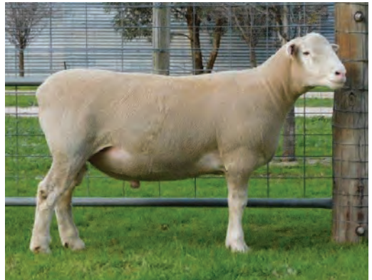
POLL DORSET Lot 40 78 TW