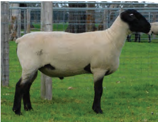
SUFFOLK Lot 5 590