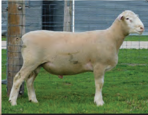
POLL DORSET Lot 45 232