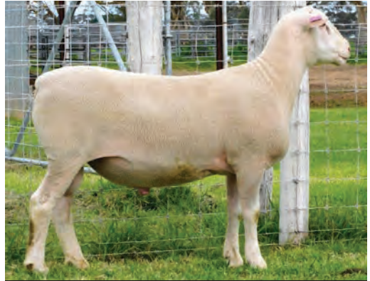
WHITE SUFFOLK Lot 22 200303