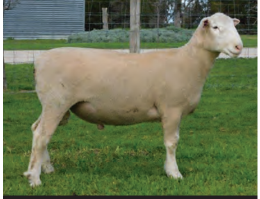
POLL DORSET Lot 44 388 TW