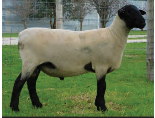
SUFFOLK Lot 10 545 TW