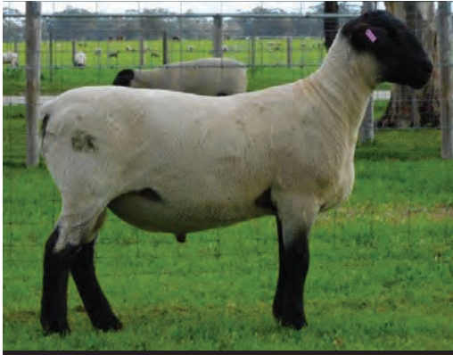
SUFFOLK Lot 9 569