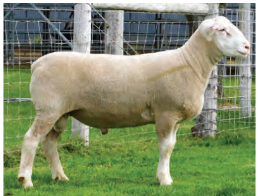
WHITE SUFFOLK Lot 24 200397