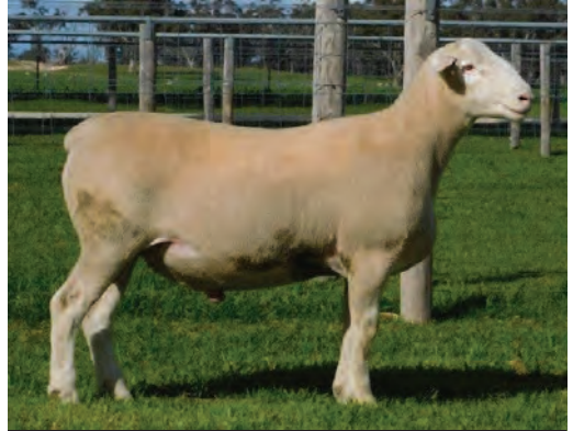
POLL DORSET Lot 38 186 TW