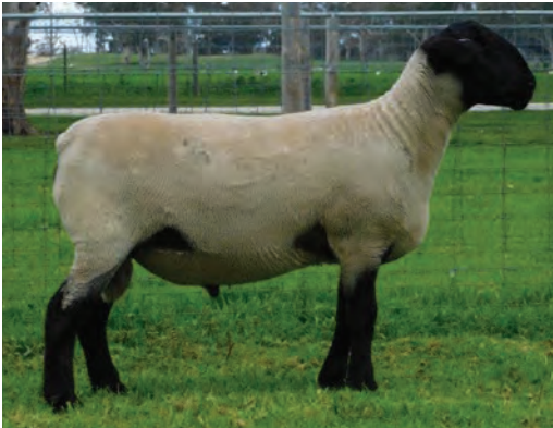
SUFFOLK Lot 3 502 TW