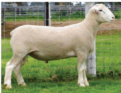
WHITE SUFFOLK Lot 30 200100 TW