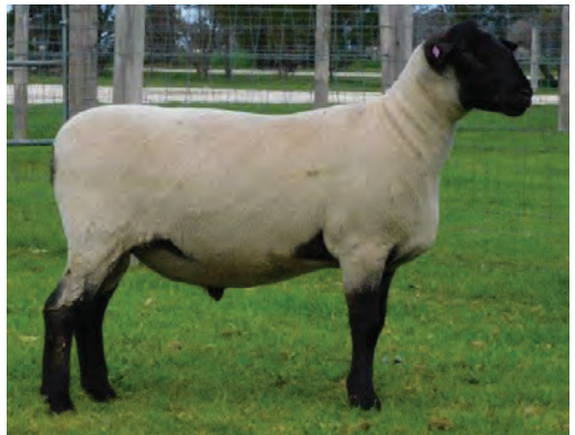
SUFFOLK Lot 6 581