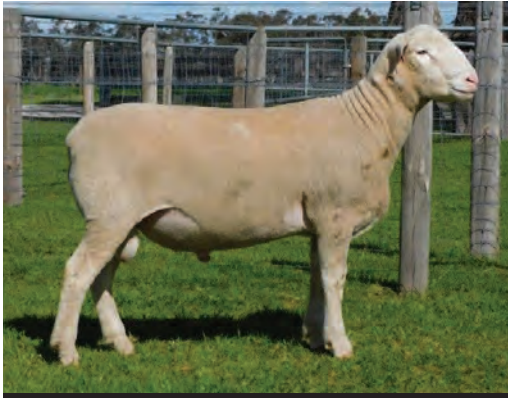
POLL DORSET Lot 33 139 TW