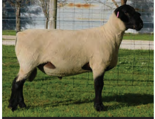
SUFFOLK Lot 8 633