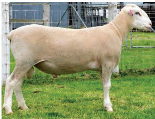
WHITE SUFFOLK Lot 27 200110 TW