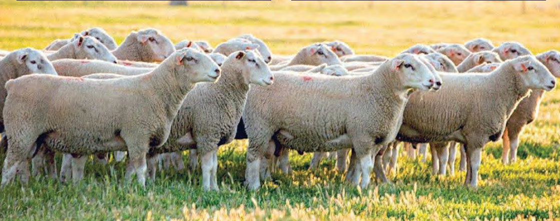
MATERNAL COMPOSITE SALE RAMS