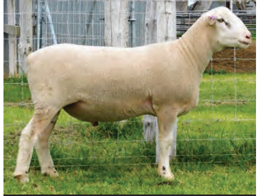
WHITE SUFFOLK Lot 20 200232 tW