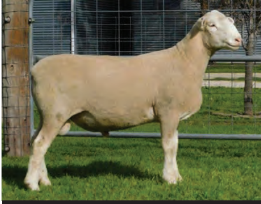
POLL DORSET Lot 43 325