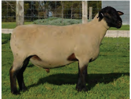
SUFFOLK Lot 4 676