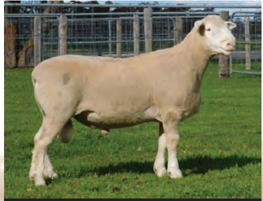
POLL DORSET Lot 46 330 TW