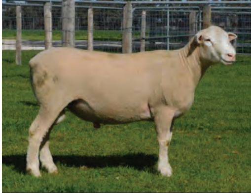
POLL DORSET Lot 37 210 TW