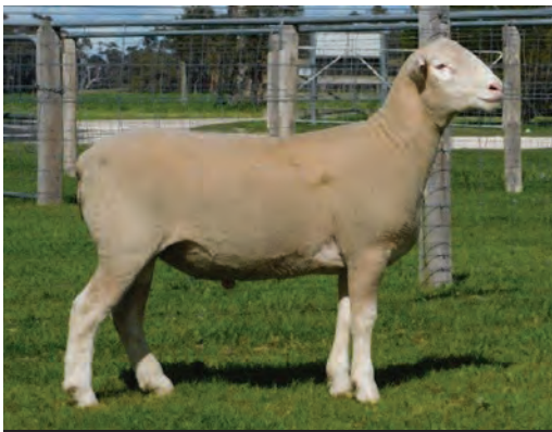
POLL DORSET Lot 35 406 TW