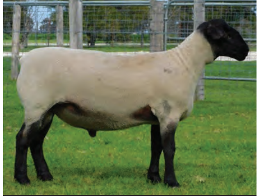
SUFFOLK Lot 2 518 TW