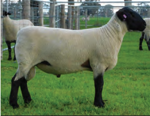
SUFFOLK Lot 1 517