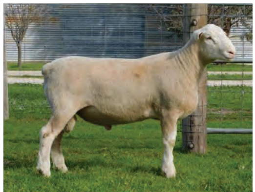
POLL DORSET Lot 42 360