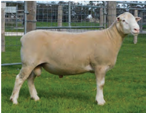
POLL DORSET Lot 39 45 TW