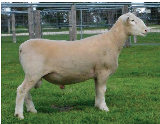
POLL DORSET Lot 41 153