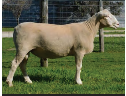
POLL DORSET Lot 32 13