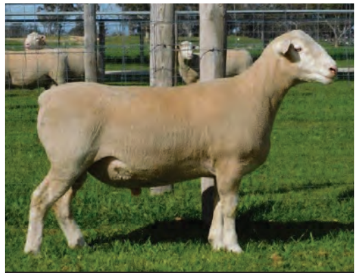
POLL DORSET Lot 36 398