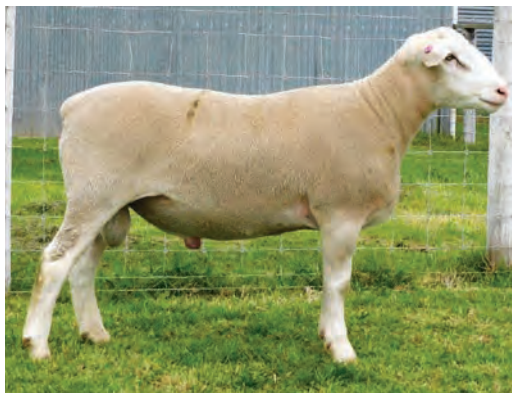
WHITE SUFFOLK Lot 28 200288 TW