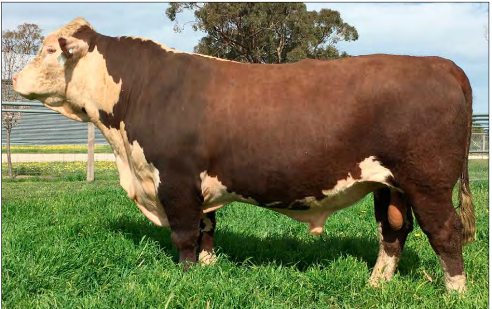
Allendale Collingwood J29