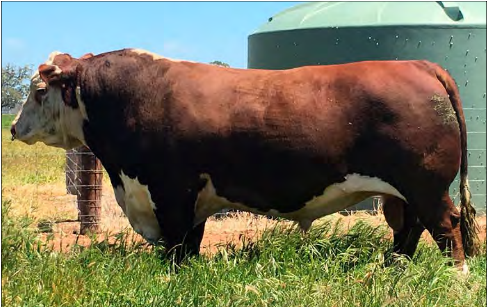
Days Robin Hood H38