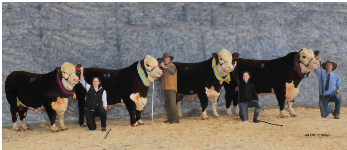
Days Whiteface won both Champion and Reserve Champion EU Index and Supermarket Index bulls at Dubbo National 2016, these four bulls averaged $40,000.

2018 SEES OUR TOP END BULLS BEING OFFERED ON FARM