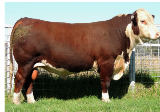
Lot 4 - DAYS HORIZON M028 (AI) (P)

These four bulls have been used on heifers and cows in the Days Whiteface herd in 2017. We eagerly await their calves, and are retaining semen for within herd use only from all four bulls.