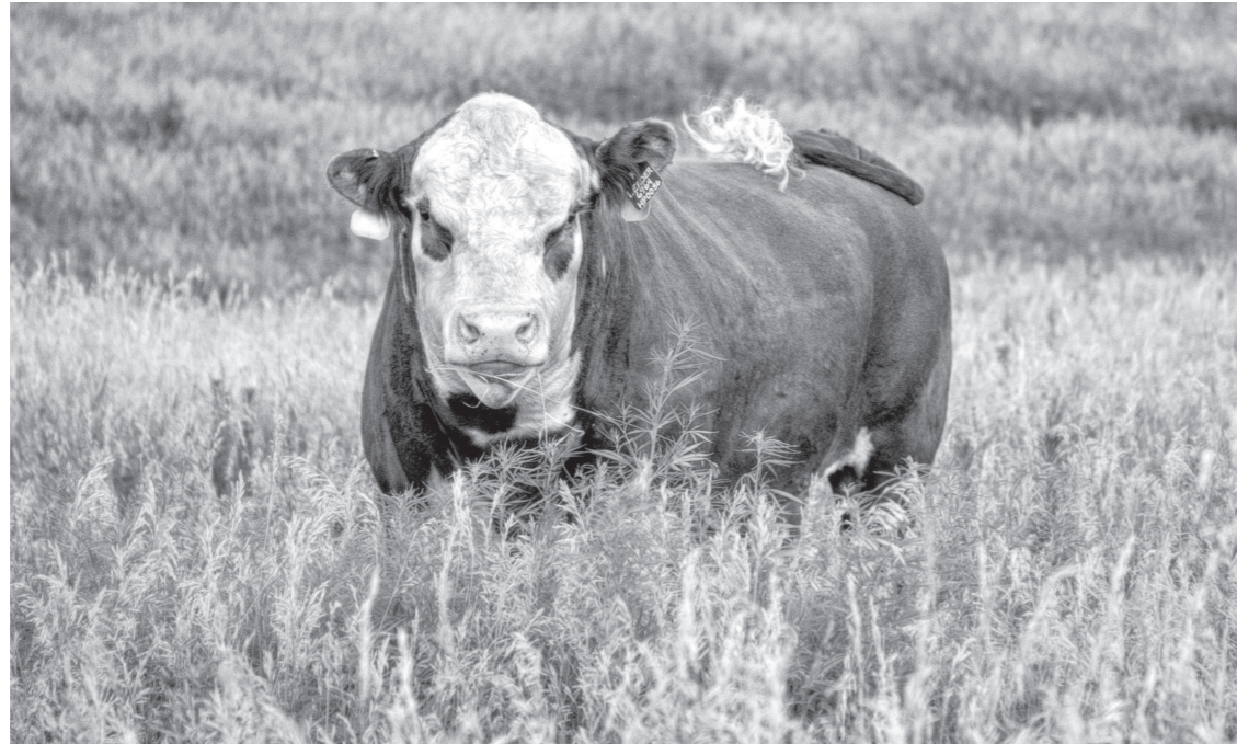
R LEADER 6964 (IMP USA) (P)