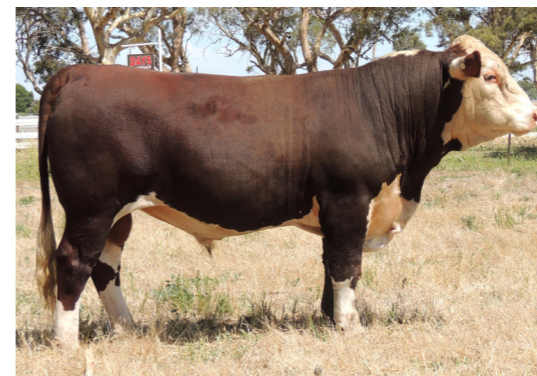
Lot 7 - DAYS HEMISPHERE M065 (P)