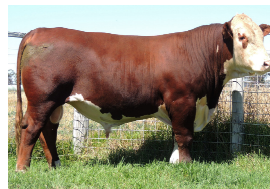
Lot 8 - DAYS BENEDICT M099 (AI) (P)