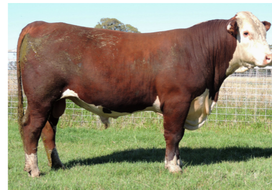
Lot 5 - DAYS HOMESTEAD M033 (AI) (P)