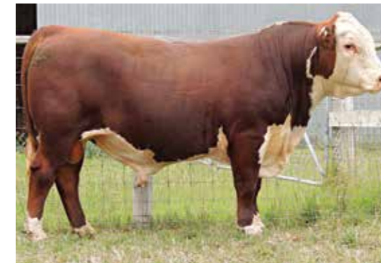
Lot 14 - DAYS N079 (AI) (P)

We are excited about the impact Leader will have on our herd. He has left low birth weights, early growth and terrific muscling in his sons and we eagerly await his daughter's contributions.