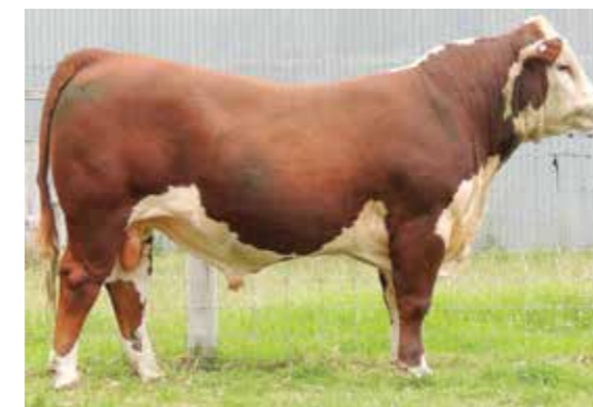
Lot 29 - DAYS IMPACT N152 (AI) (PP)