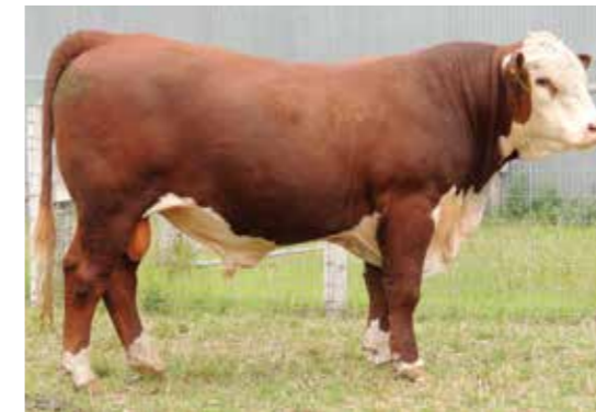
Lot 15 - DAYS INSPECTOR N114 (AI) (PP)