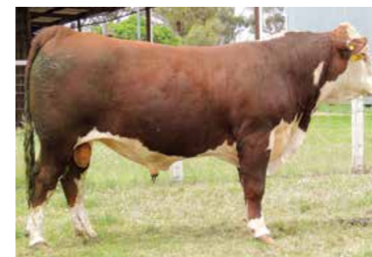
Lot 30 - DAYS HIJACKER N167 (AI) (PP)