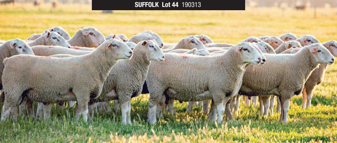
MATERNAL COMPOSITE SALE RAMS