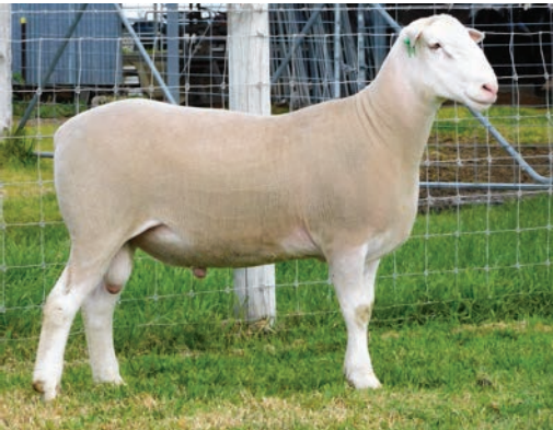
WHITE SUFFOLK Lot 21 190321