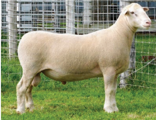
WHITE SUFFOLK Lot 15 190015