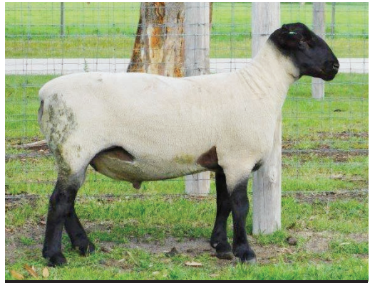
SUFFOLK Lot 41 190330 TW