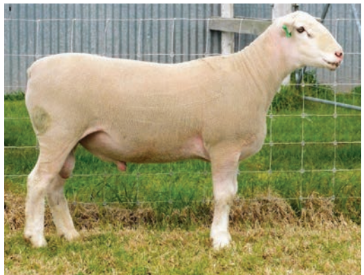
WHITE SUFFOLK Lot 18 190108