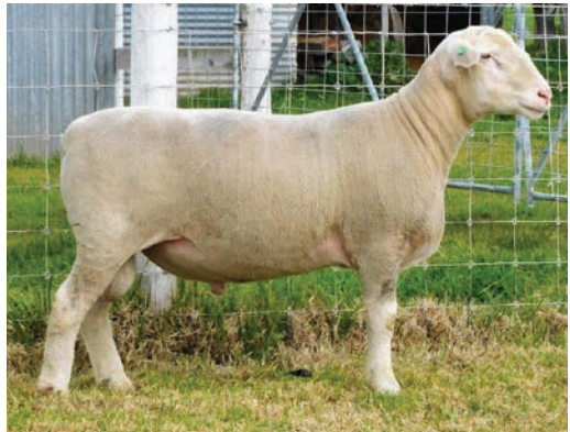
WHITE SUFFOLK Lot 28 190130