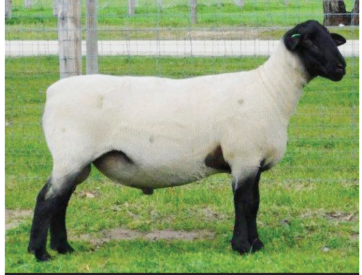
SUFFOLK Lot 31 190257 TW