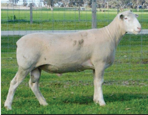
POLL DORSET Lot 13 190122 TW