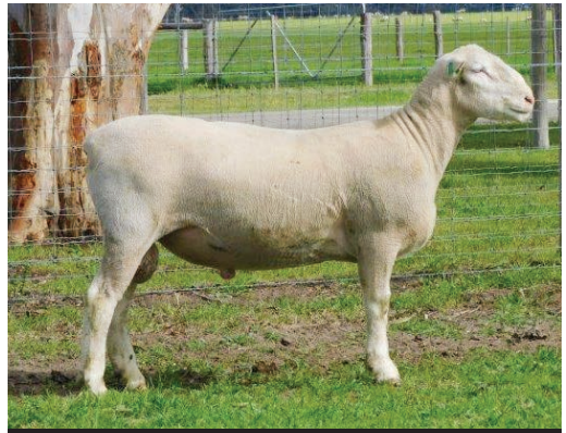
POLL DORSET Lot 12 190338 TW