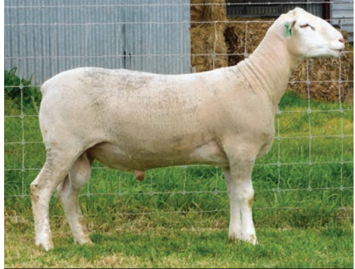
WHITE SUFFOLK Lot 26 190060