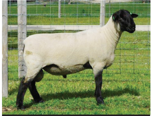
SUFFOLK Lot 39 190389