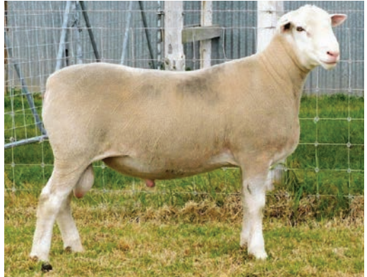
WHITE SUFFOLK Lot 16 190007