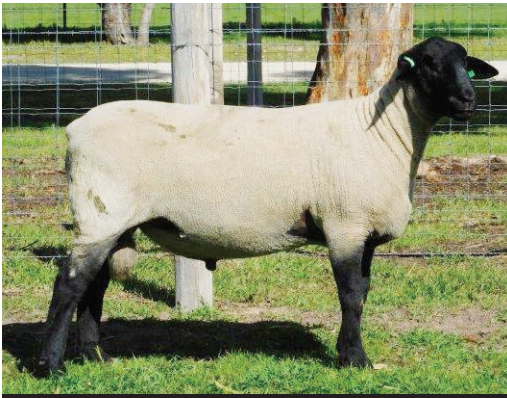
SUFFOLK Lot 40 190460