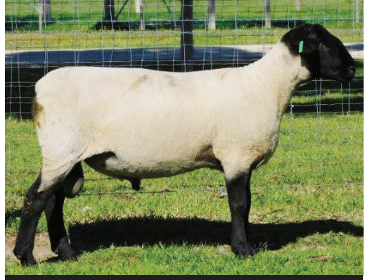
SUFFOLK Lot 37 190266 TW