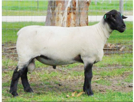
SUFFOLK Lot 33 190459 TW