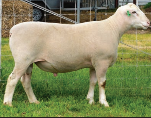
WHITE SUFFOLK Lot 19 190053