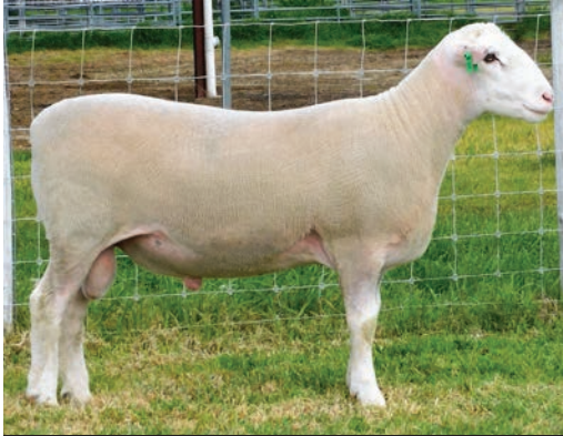
WHITE SUFFOLK Lot 25 190216