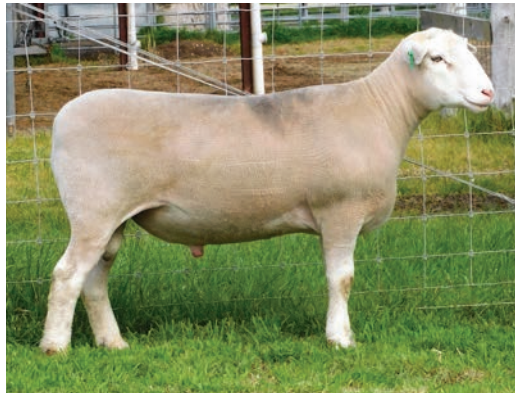
WHITE SUFFOLK Lot 22 190074