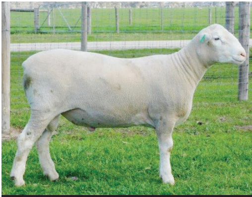
POLL DORSET Lot 11 190211 TW