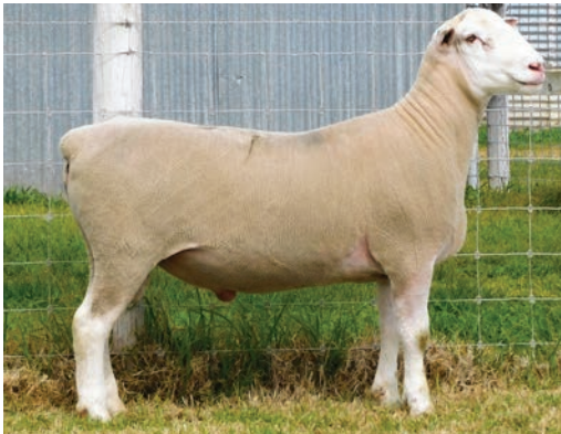
WHITE SUFFOLK Lot 27 190346