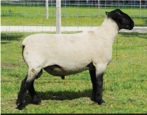
SUFFOLK Lot 38 190410 TW