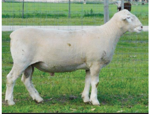
Lot 2 190011