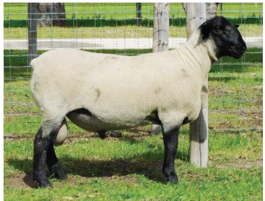
SUFFOLK Lot 35 190437 TW