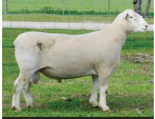
POLL DORSET Lot 8 190158