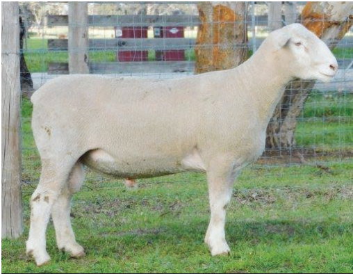
Lot 5 190101 TW