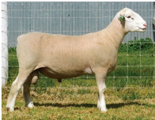
WHITE SUFFOLK Lot 29 190250