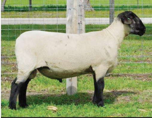
SUFFOLK Lot 30 190491 TR