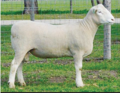
Lot 1 190212 TW