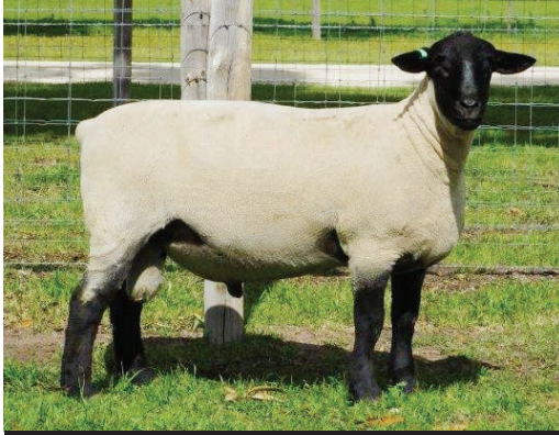
SUFFOLK Lot 42 190462