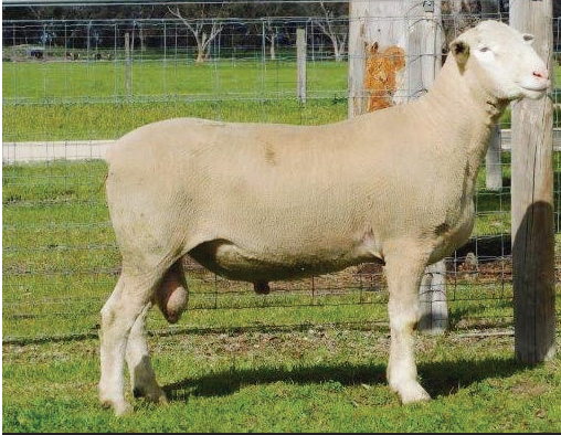
Lot 3 190071 TW