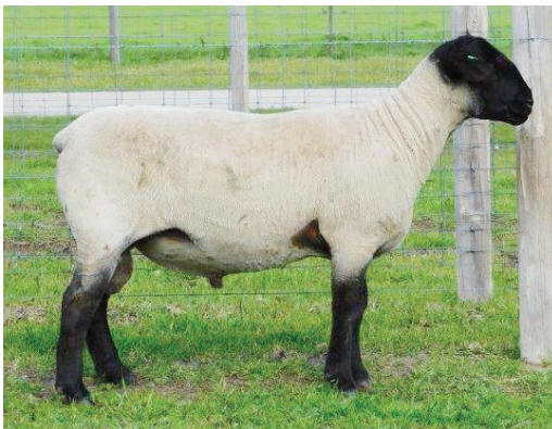
SUFFOLK Lot 34 190439