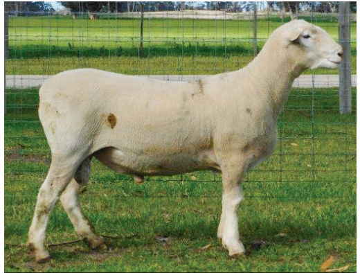
Lot 6 190262