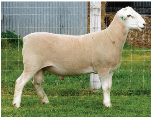
WHITE SUFFOLK Lot 17 190093