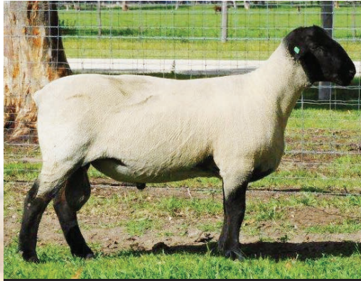
SUFFOLK Lot 44 190313