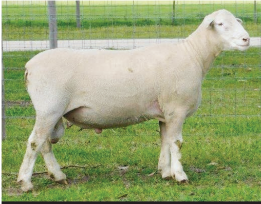
POLL DORSET Lot 9 190206 TW