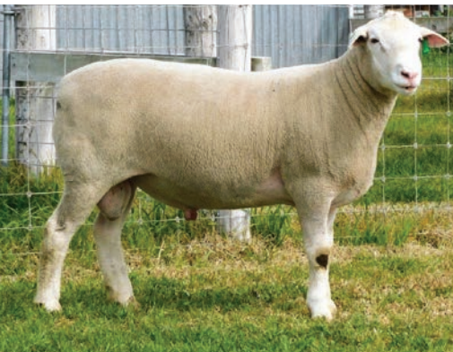
WHITE SUFFOLK Lot 23 190009