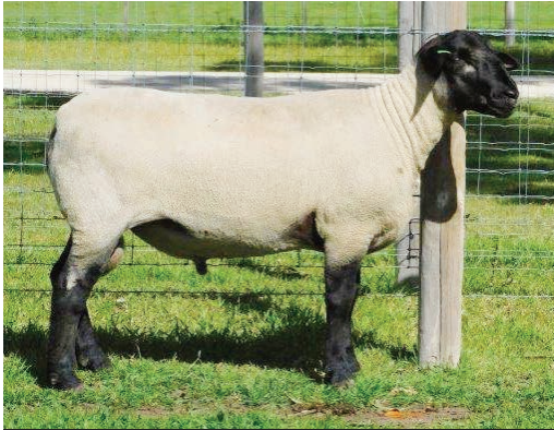
SUFFOLK Lot 32 190381 TW