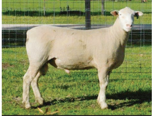
POLL DORSET Lot 14 190104