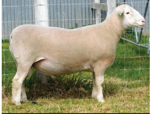
WHITE SUFFOLK Lot 20 190109