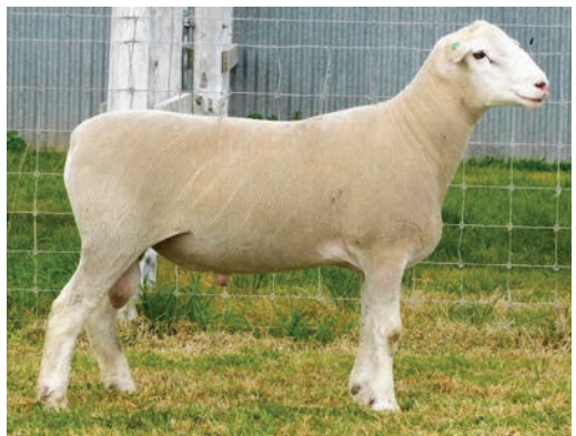
WHITE SUFFOLK Lot 24 190151