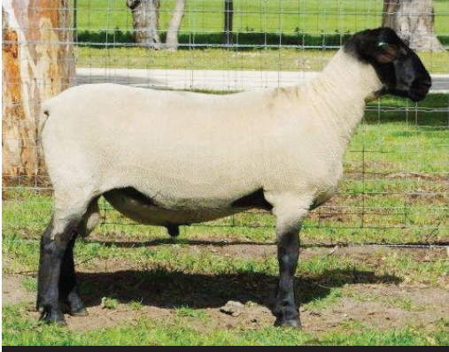
SUFFOLK Lot 36 190283