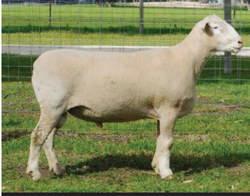
POLL DORSET Lot 7 190008 TW