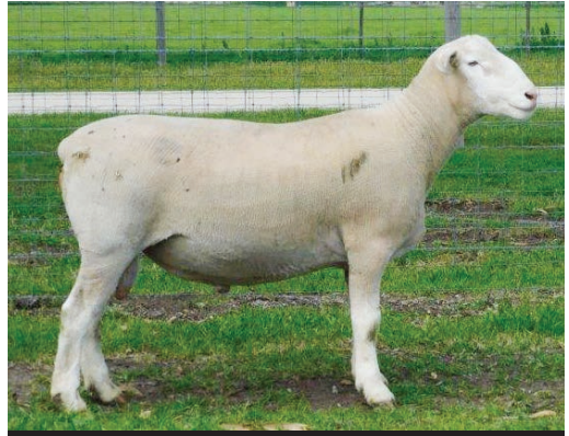
POLL DORSET Lot 10 1900100