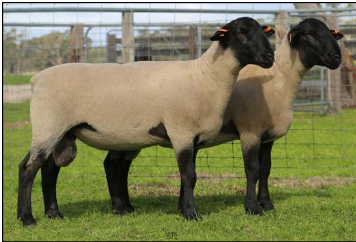
Lots 34 and 35