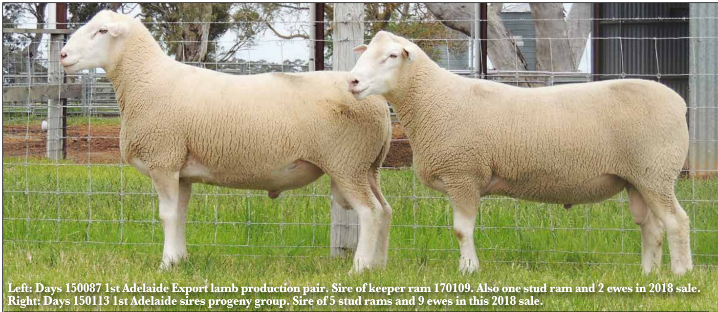
Left: Days 150087 1st Adelaide Export lamb production pair. Sire of keeper ram 170109. Also one stud ram and 2 ewes in 2018 sale. Right: Days 150113 1st Adelaide sires progeny group. Sire of 5 stud rams and 9 ewes in this 2018 sale.