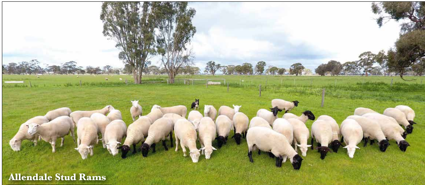
Allendale Stud Rams