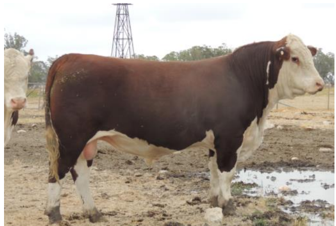
Lot 7 Heifers first calf. First Blackberry son. Top 5% for growth traits.