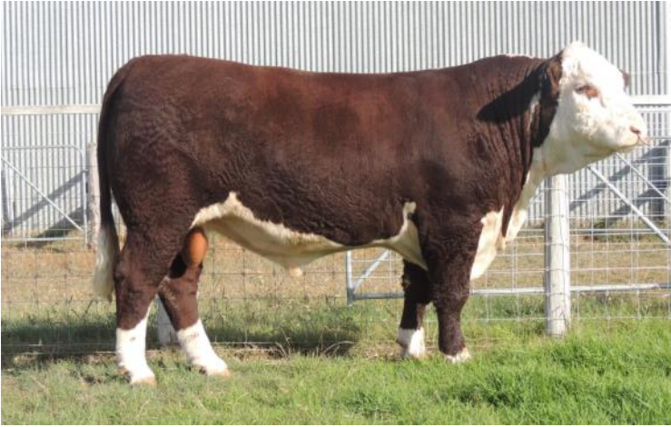
Destiny H151 —Sired by Waterhouse Equal top price $30,00 Selling to Cascade & Bobanken