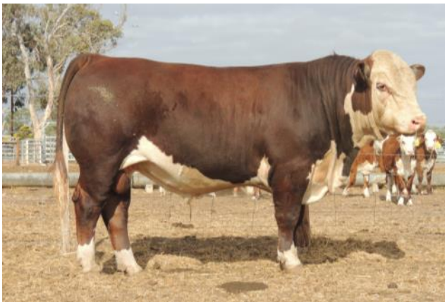
Lot 6 Used on heifers. By outcross sire Mr Hereford 11X imported U.S.A and from Calibre's dam.