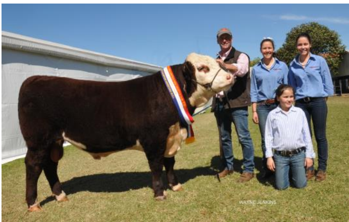
Days Wizard J207 Grand Champion Bull For sale Wodonga 2015