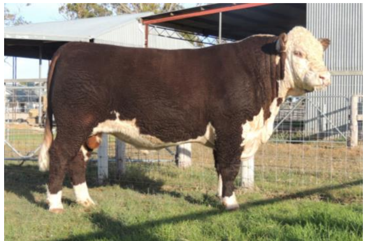
Patrick H37 —Sired by South Bukalong Wallace 2 Reserve Senior Champion Winner EU Performance class Sold for $24,000 to Chester & Quamby Plains