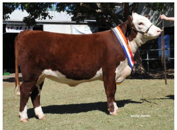
Days Fancy H213 Grand Champion Female

We would like to thank everyone that supported our programme in 2014