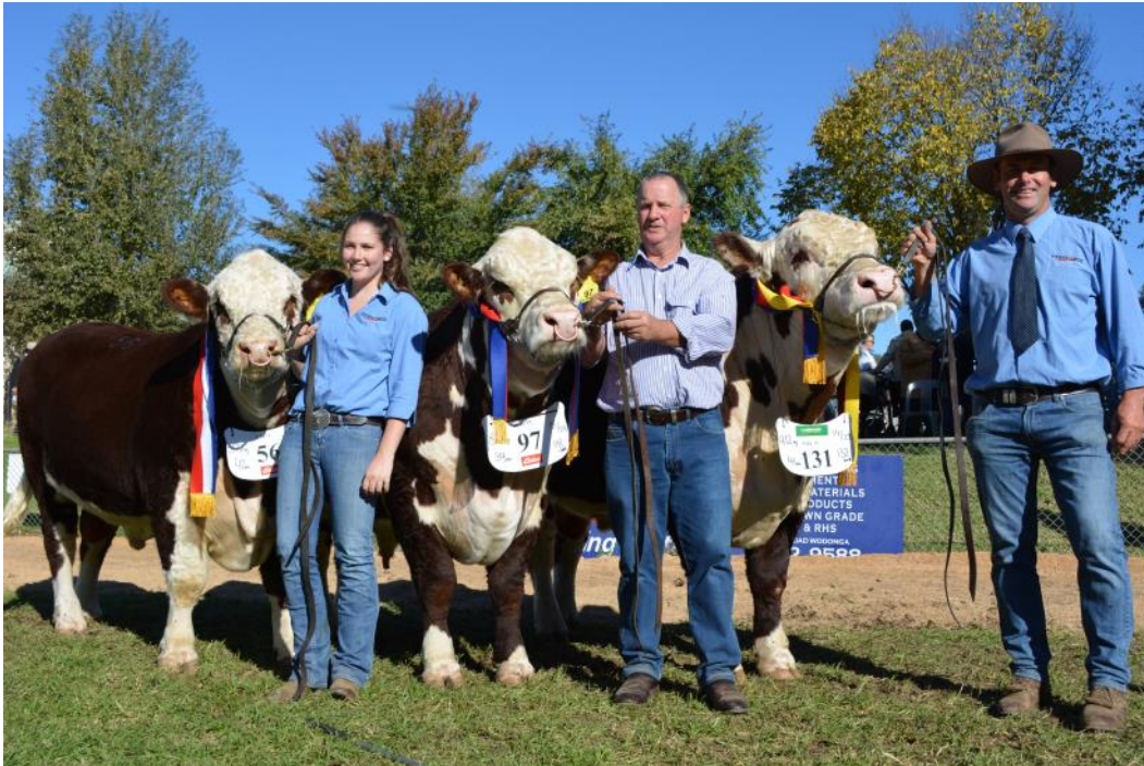
Junior, Intermediate & Senior Champions.